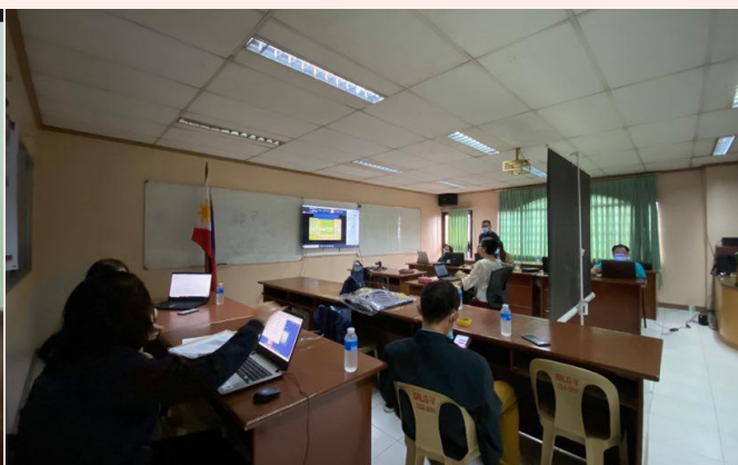
Technical staff composed of PDMU and IT personnel assisted during the Dagyaw.

The Dagyaw: Regional Townhall Meetings or Dagyaw in short is one of the programs of the DILG, DBM and PIA implemented to encourage participation of the citizen in governance. The government opens a safe space for national government agencies and all participating citizens including civil society organizations and other non-government organizations to discuss issues affecting the lives of the citizens and the corresponding response of the government. Its main goal is to promote citizen participation in governance as well as to measure the efficacy of such responses.