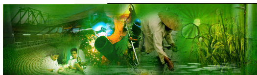
COMPREHENSIVE LIVELIHOOD AND EMERGENCY EMPLOYMENT PROGRAM (CLEEP)

CLEEP Comprehensive Livelihood and Emergency Employment Program