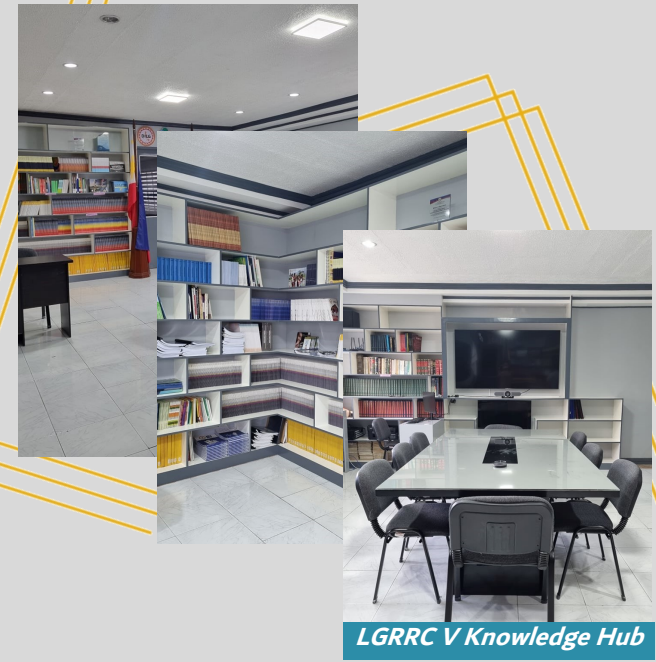
LGRRC V Knowledge Hub

Albay | (+63 52) 742 2483 | dilgalbay@gmail.com Camarines Norte | (+63 977) 114 4646 / (+63 949) 133 2459 dilgcamarinesnorte2020@gmail.com Camarines Sur | (+63 970) 626 9827 | dilgcamsur@gmail.com dilgcamsurofficial@yahoo.com Catanduanes | (+63 52) 811 4218 | dilgcatanduanes2021@gmail.com Masbate | dilgmasbate2020@gmail.com Sorosogon | (+63 56) 211 4082 / (+63 997) 376 1123 dilgsorsogon@yahoo.com